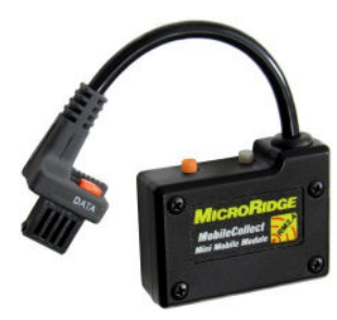
With Transmitter Cable (sold separately)